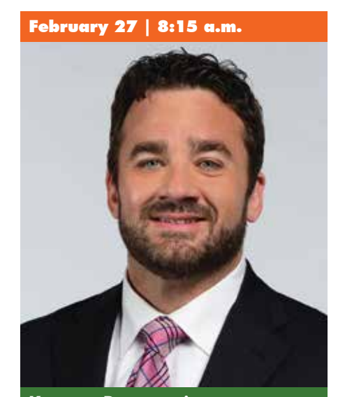
Keynote Presentation Safety in Football